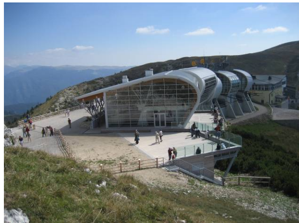
View from north