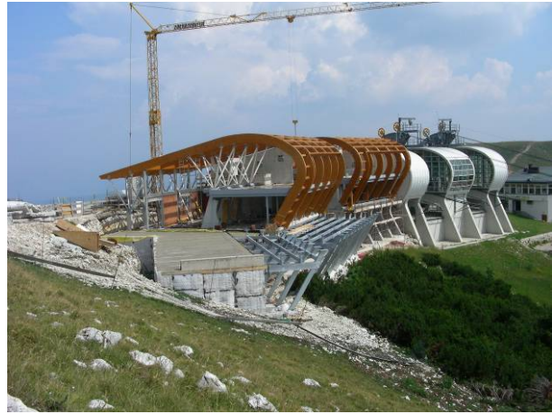
Building yard– view from north