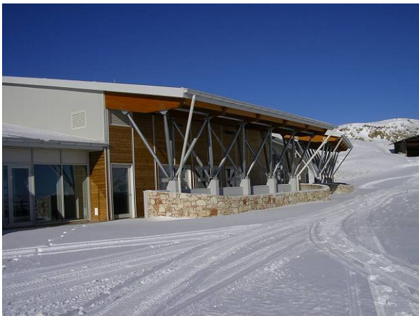
View from south-east